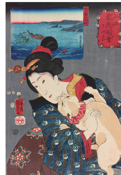
Utagawa Kuniyoshi “Famous Products of the Provinces with Women's Postures: Looking Painful” Private Collection