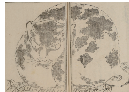
Hiroshige Utagawa III From the book, Hyakubyo Gafu (Pictures of One Hundred Cats)