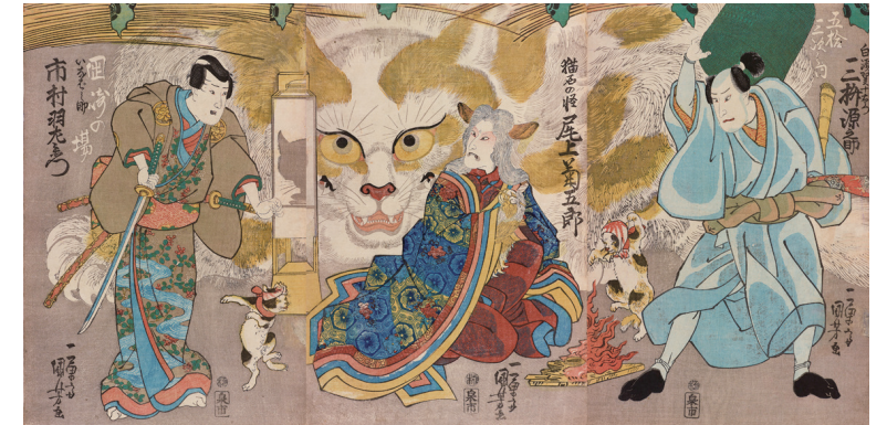
Utagawa Kuniyoshi “Fifty-three Stations of the Tōkaidō Road: Okazaki” Private Collection

(a cat with supernatural powers, sometimes capable of shape-shifting or cursing humans)