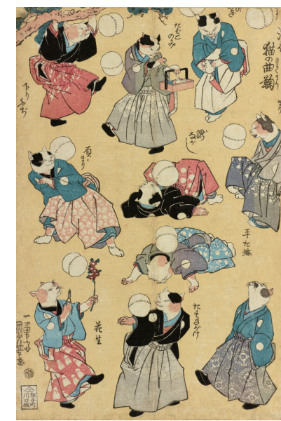
Utagawa Kuniyoshi “Fashionable Cats Juggling Balls” Private collection