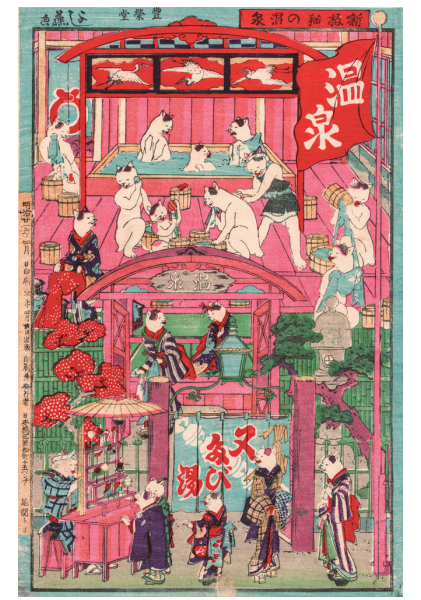
Utagawa Yoshifuji “Hotspring Spa for Cats” Private Collection